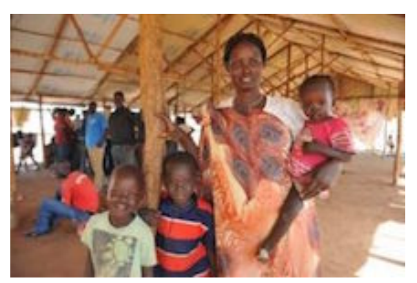
Nyumazi Reception Center Adjumani Refugee Settlement, Uganda

PWRDF is responding to this need through the ACT Alliance with a grant of $30,000 as part of a larger program to provide hygiene items, blankets, clothing, and kitchen kits, build communal shelters for the most vulnerable, build community and school latrines, construct 12 classrooms and 450 3-seater school desks, provide inclusive learning and teaching materials, and offer teacher trainings in refugee context. This grant is in addition to the of $20,000 PWRDF provided to the Sudanese Development and Relief Agency (SUDRA) in