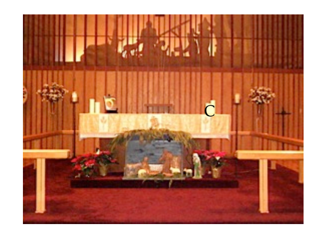
Page 12 Christmas Memories at St. Catherine's