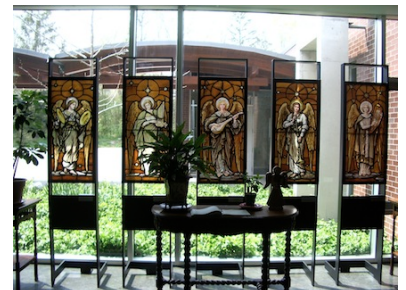
Angel Glass Windows