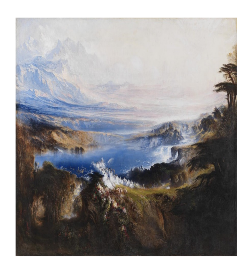
Creation Season September 5, 2021 10 am Service