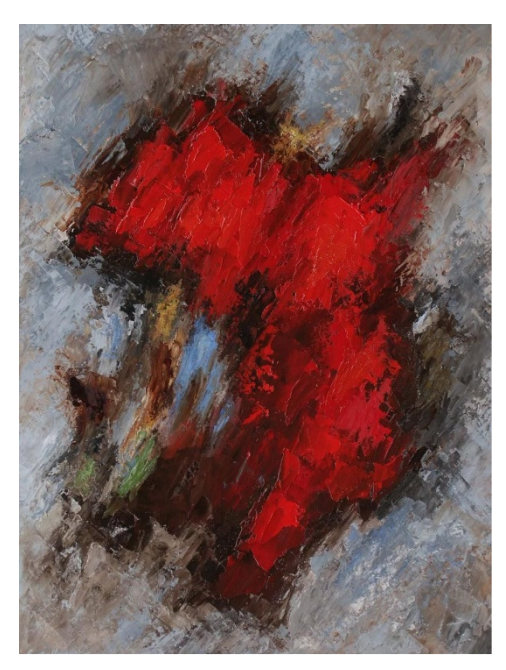
Artist: Curtis Verdun

God who gives to life it's goodness, God creator of all joy, giver of all human freedom, God who blesses tool and toy: teach us now to laugh and praise you, deep within your praises sing, till the whole creation dances for the goodness of its King,