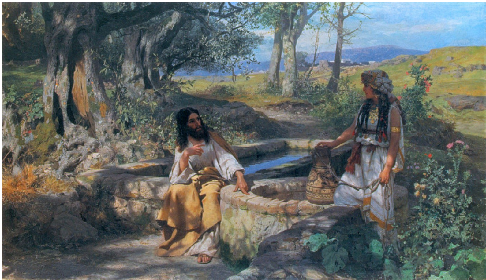
Artist: Henryk Siemiradzki

People: Wait for the LORD and be strong. Take heart and wait for the LORD!